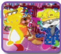
The Magical Sweet Shop